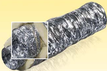
605-Sono M0 605-Sono M1

Flexible aluminium foil heat-insulated air ducts