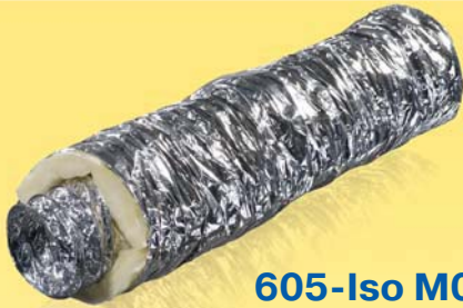
605-Iso M0 605-Iso M1

Flexible aluminium foil heat-insulated air ducts