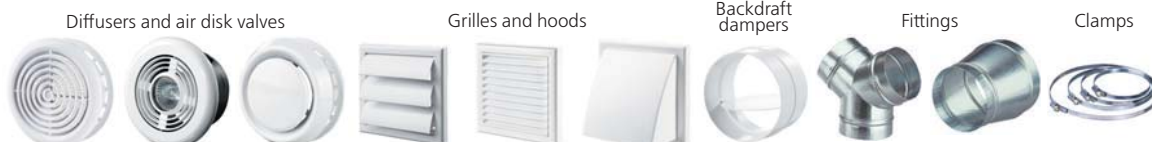
Diffusers and air disk valves