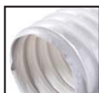
White ( )