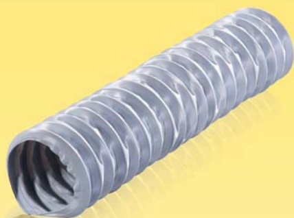
Flexible non-insulated PVC film air ducts with steel wire frame (700 µm)