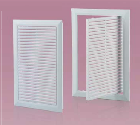
Plastic access doors opening from either side