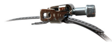
Easy locking mechanism for the CB and CBR clamps