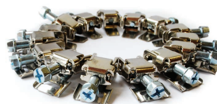
Locking device SU 50 for CBR 3000