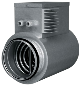
Duct heater for supply air post-heating with external control