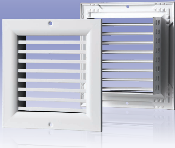
Single-row ventilation grille with fixed vanes