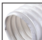
White ( )