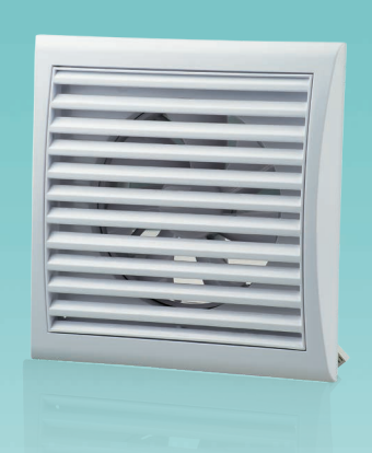
Axial fans for exhaust ventilation with air flow up to 78 m3/h