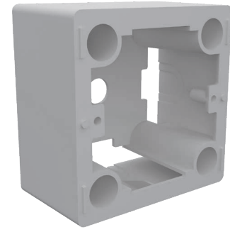
MKN-3 (for surface mounting)