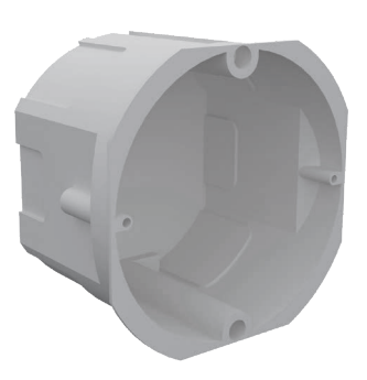
MKV-4 (for flush mounting)