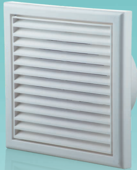
Axial fans for exhaust ventilation with air flow up to 80 m 3 /h