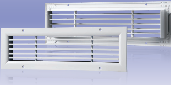
Single-row linear horizontal ventilation grille with fixed vanes