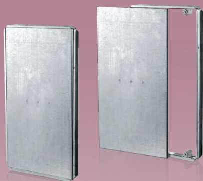
Access doors on a metal frame recessed for ceramic tiles