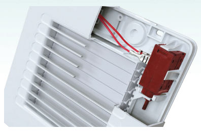
Fan not running - the shutters are CLOSED

Mounting into ventilation shafts or connection to Ø 100 mm air ducts.