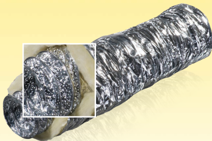
605-Sono M0 605-Sono M1

Flexible aluminium foil heat-insulated air ducts