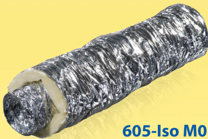
605-Iso M0 605-Iso M1

Flexible aluminium foil heat-insulated air ducts