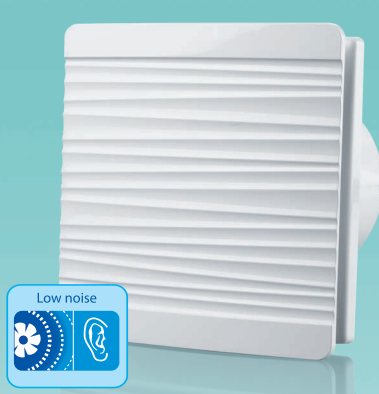
Low-noise and low-power extract axial fan with air flow up to 85 m<sup>3</sup>/h